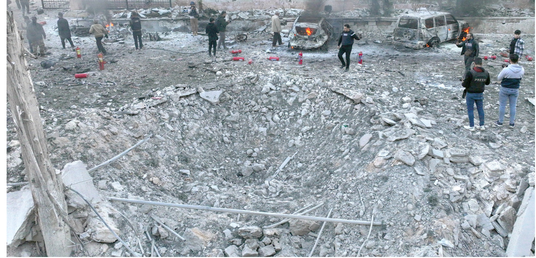
People stand at the site of an airstrike that targeted Syria's rebel-held northern city of Idlib

● UN Security Council to hold emergency meeting on Syria Tuesday: diplomatic sources