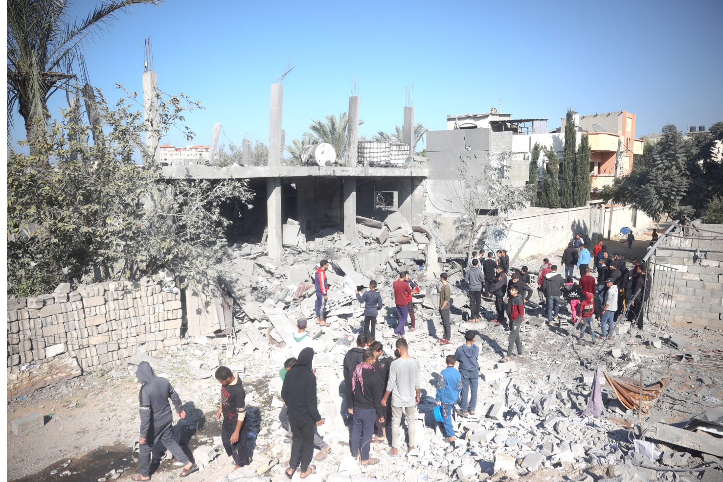
Palestinians inspect the destruction at the site of an Israeli strike that targeted a house in the Bureij refugee camp in the central Gaza Strip

The United Nations chief said yesterday the situation in war-torn Gaza was "appalling and apocalyptic", warning conditions faced by Palestinians in the territory may amount to the "gravest international crimes".