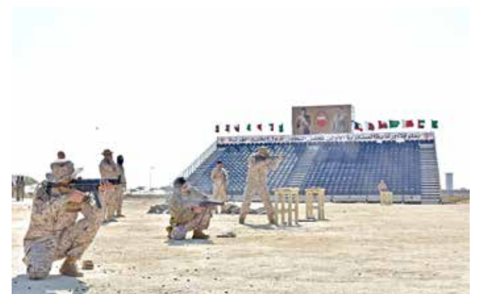
TDT | Manama

The inaugural Gulf Cooperation Council (GCC) Military Shooting Championship, hosted by the Bahrain Defence Force (BDF) and organised by the Military Sports Union, is set to commence tomorrow morning.