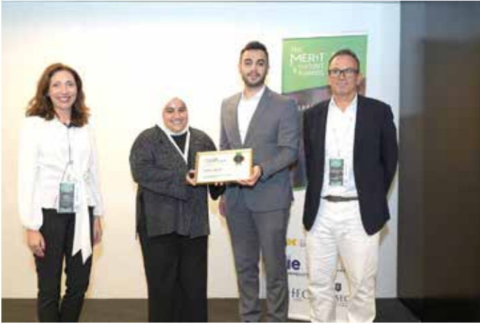
The award ceremony

Since 2017, MERIT has been providing a unique forum for HR and Learning & Development directors of international companies from different industries and executive education leaders to recognize achievements and elevate organizational, leadership and people development, and elevate the state of corporate learning "The MERITS" have been designed to award impactful transformational in-