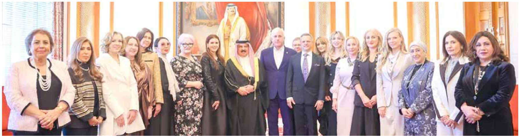
His Majesty King Hamad bin Isa Al Khalifa received a delegation of Russian businesswomen visiting the Kingdom at Al Sakhir Palace. HM the King welcomed the delegation, expressing hope that their visit would pave the way for new opportunities in economic, trade, and investment cooperation, bringing prosperity and growth to both countries and their peoples. He commended the strong historic ties between Bahrain and Russia and the mutual commitment to develop them in all domains. HM the King affirmed that the Kingdom's strategic location has made it an ideal destination for regional and global investments. His Majesty highlighted the ongoing commitment to enhancing an investor-friendly environment by offering various incentives, advantages, and skilled human resources across all sectors.