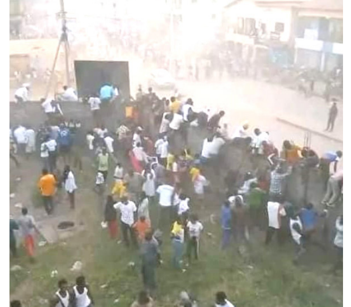
AFP | Conakry, Guinea

Stampedes at a football match killed 56 people in Guinea's second-largest city of N'Zerekore, the junta-controlled government said Monday. "Protests of dissatisfaction with refereeing decisions led to stone-throwing by supporters, resulting in fatal stampedes" at Sunday's match, the government statement said, which was published as a news ticker on national television. "Hospital services have put the provisional death toll at 56," it added.